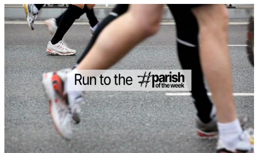
COA will be featured as Parish of the Week 11-16 July.